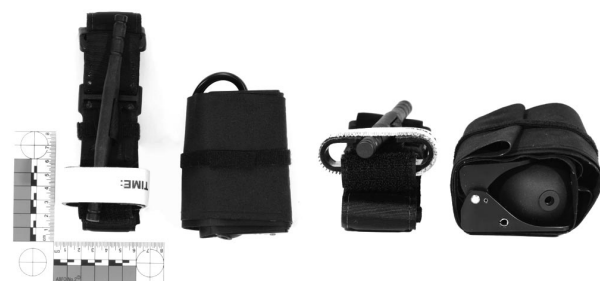
Figure 2. CAT (left) and EMT (right).