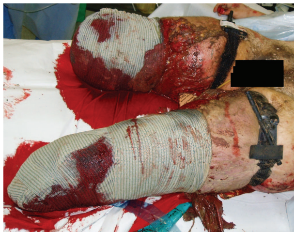
Figure 1. An example of a traumatic above knee amputation with persistent hemorrhage despite a CAT tourniquet.